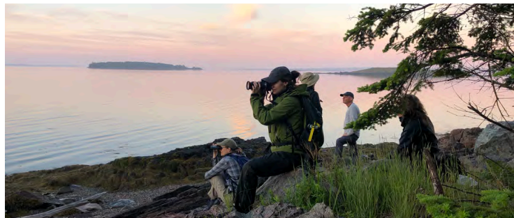
The QLF field team conduct a seabird survey on the coast of Disher Conservation Easement, in Bocabec, New Brunswick

In Nova Scotia, the team completed significant work in two priority areas identified by partner organization, the Nova Scotia Nature Trust (NSNT): mapping and stewardship tasks. The former took the form of digitally mapping selected nature preserves, which helps the NSNT keep close tabs on nature preserve's recovery and organize work parties as necessary.