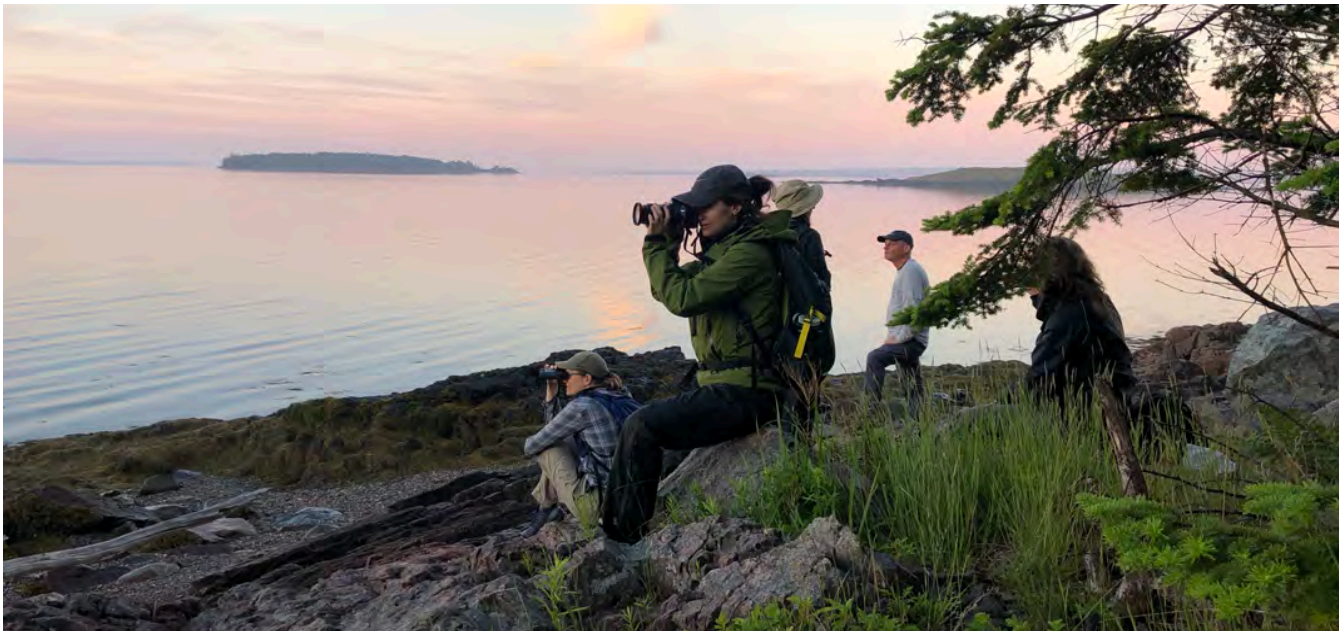
The QLF field team, along with Nature Trust New Brunswick (NTNB) staff and stewards, conduct a seabird survey on the coast of Disher Conservation Easement, in Bocabec, New Brunswick. The data collected during the species surveys in this region contributes to longitudinal studies, informing future conservation efforts

The overarching goal of the program, Conservation and Stewardship, Maritimes, is the conservation of birds and the stewardship of their environments in protected areas principally in New Brunswick and across the Maritimes. The program is directed in partnership with the Nature Trust New Brunswick - a charitable land conservation organization that is responsible for conserving and stewarding more than 60 nature preserves throughout the province. Through teaching environmental awareness and monitoring species in significant areas in New Brunswick, and the stewardship of marine environments and preserves, the next generation of leaders and practitioners are engaged and inspired. This year, QLF will expand the program across the Maritimes to address the drastic decline of bird species in the region's changing climate.