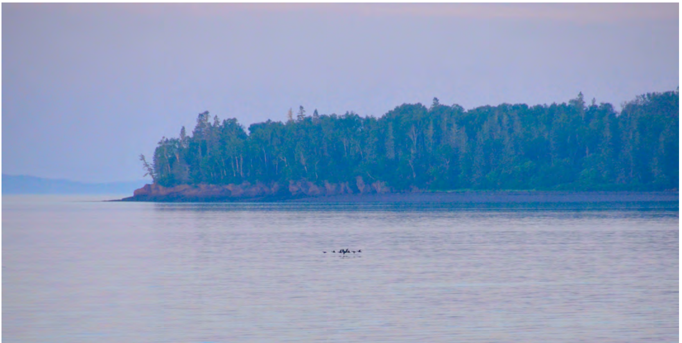
Looking out at the Bay of Fundy from the shoreline of Disher Conservation Easement in Bocabec, New Brunswick, an area of land protected by the Nature Trust of New Brunswick (NTNB). The NTNB partnered with QLF in 2021 to conduct conservation activities across the southern region of the province.

The spectacular setting of the Point Amour light station in the Labrador Straits serves as location for a week-long youth program each summer. Students travel from southern Labrador and the Quebec Lower North Shore to attend the program that accommodates up to 40 youth. They learn practical information and skills in bird and whale monitoring, impacts of climate change on ice and icebergs, marine debris, protecting wetlands, and wildlife conservation.