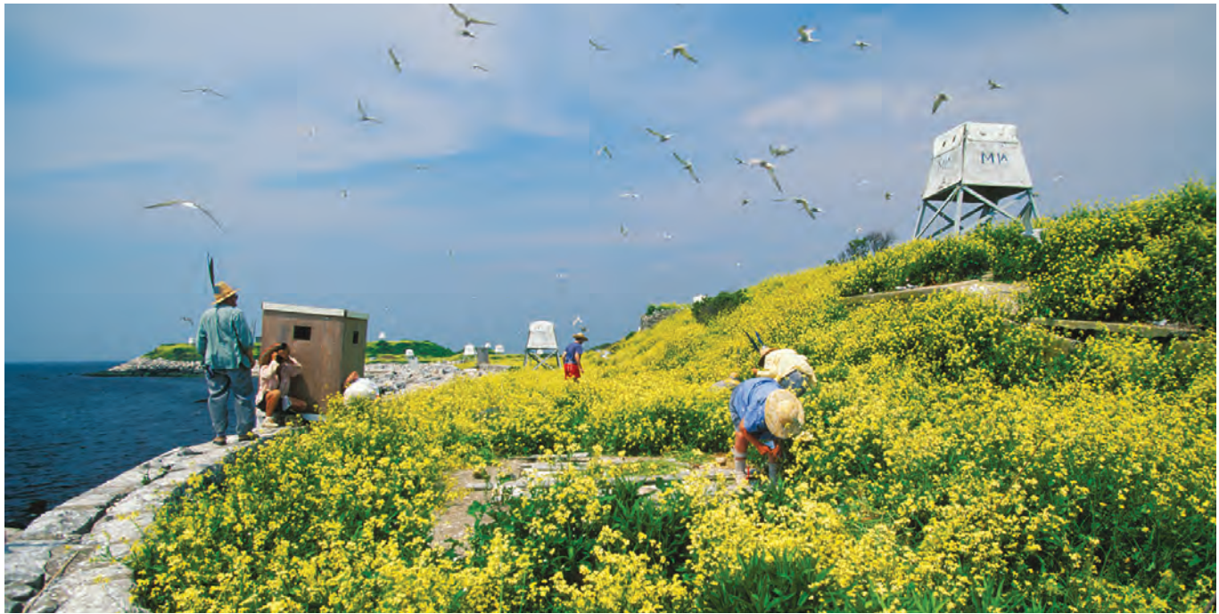
Great Gull Island is the largest nesting colony of Common and Roseate Terns in the Western Hemisphere. Common and Roseate Terns breed on Great Gull and migrate thousands of miles each fall to South America.