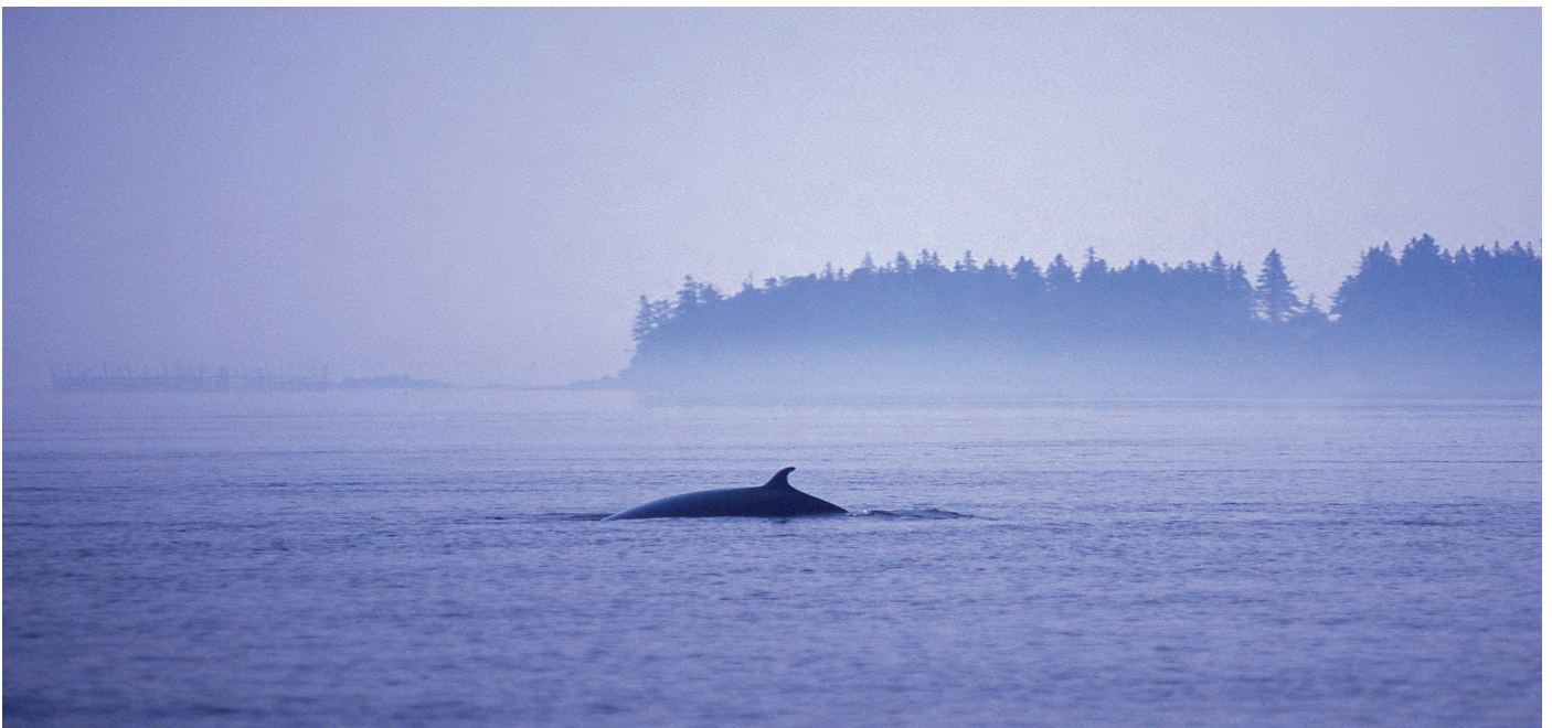
Minke whale ( Balaenoptera acutorostrata ) in the early morning fog off Deer Island, New Brunswick. This species is monitored in the Labrador Straits as part of QLF's Aquatic Species At Risk Program.

Conservation Exchange Programs foster knowledge, experience and innovation across borders while promoting international cooperation between organizations and individuals facing common conservation challenges. Exchanges focus on biodiversity conservation, community-based natural resource management, migratory birds, forest stewardship, privately protected areas, and wildlife conservation. The International Conservation Exchange Programs scheduled for 2021 are now postponed indefinitely and include The East Asia Conservation Exchange Program (in Mongolia) and the Middle East Conservation Exchange Along the Rift Valley/Red Sea Flyways in Jordan.