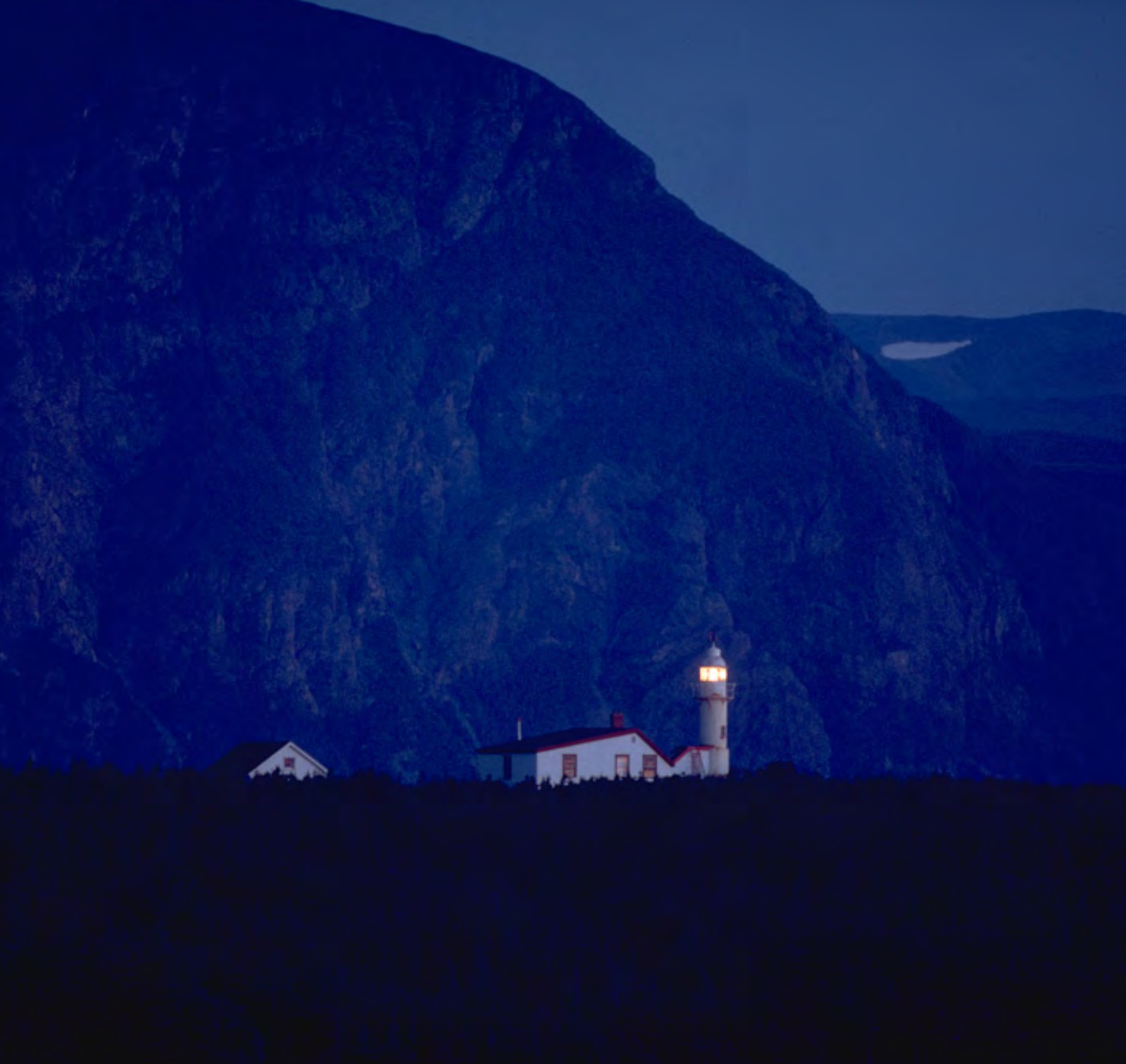
Lobster Cove, Great Northern Peninsula of Newfoundland