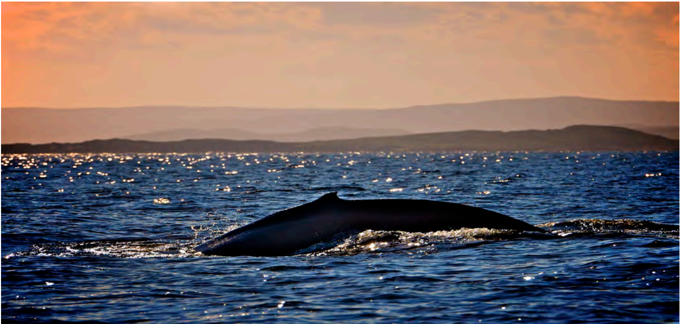
Humpback whale ( Megaptera novaeangliae) off Conche, Newfoundland, monitored by QLF's Aquatic Species at Risk Program