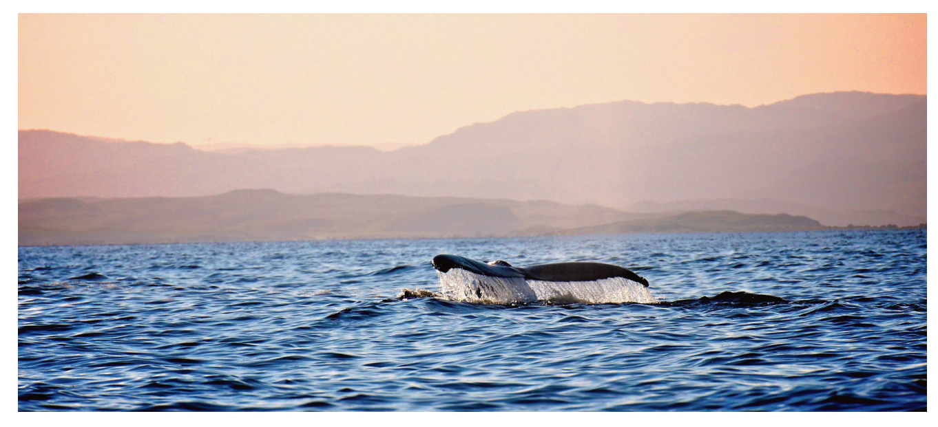
Humpback whale ( Megaptera novaeangliae ) off Conche, Newfoundland, monitored by QLF's Marine Species at Risk Program

Interns have an important role in coordinating several beach clean-ups in areas where plastic marine debris washes onshore and recording the volume and weight of that debris. These data points have substantiated the extent of the problem and helped inform the action strategies that are being implemented. QLF Interns also teach youth in schools and summer workshops about steps they can take to prevent marine debris from occurring.