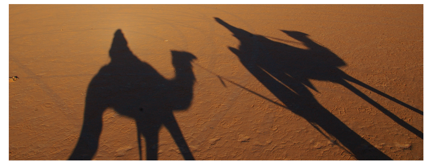
Early morning desert shadows, Wadi Rum, known as The Valley of the Moon in southern Jordan.

This program is tremendously exciting as the Rift Valley/Red Sea Flyway is one of the most important bird migration corridors in the world. Each spring, more than 500 million birds (consisting of 350 species) follow the Great Rift Valley where they diverge to Europe and Asia. Of these migrating birds, one and a half million are soaring birds.