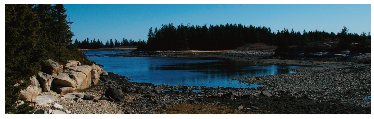
Schoodic Point, Acadia National Park, Winter Harbor, Maine.