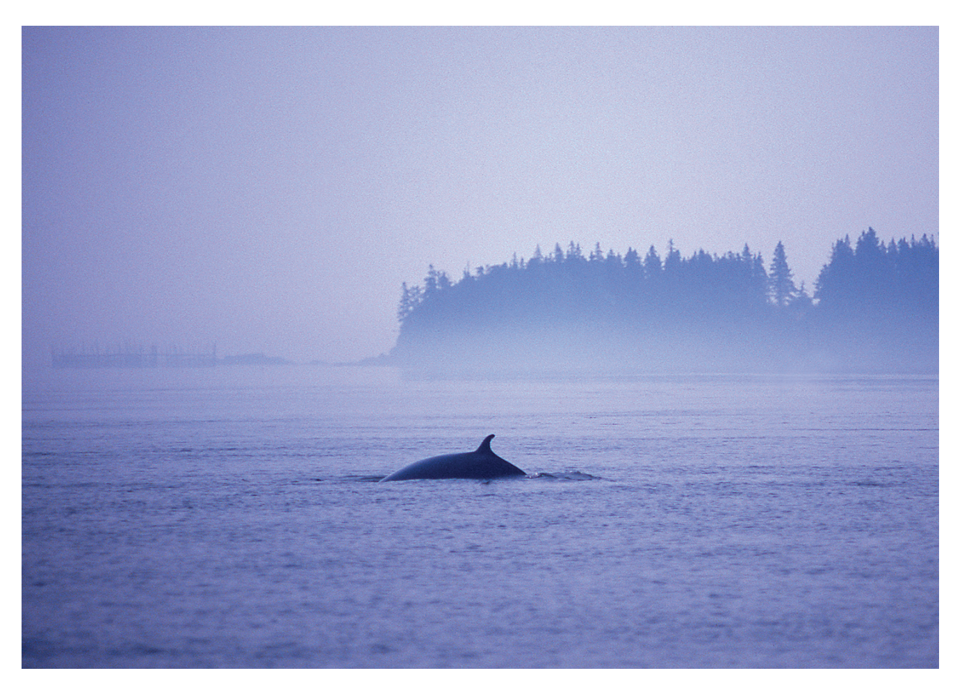
Minke whale (Balaenoptera acutorostrata) in the early morning fog off Deer Island, New Brunswick. This species is monitored in the Labrador Straits as part of QLF's Marine Species At Risk Program.

QLF created International Programs nearly 40 years ago to foster an exchange of experience and innovations among organizations and individuals in communities and regions facing similar challenges and opportunities. Organized around a thematic focus on stewardship – efforts to create, nurture, and enable responsibility in landowners and resource users to manage and protect land and its natural and cultural heritage – the program works on a regional basis, nationally within the United States, and inside global frameworks.