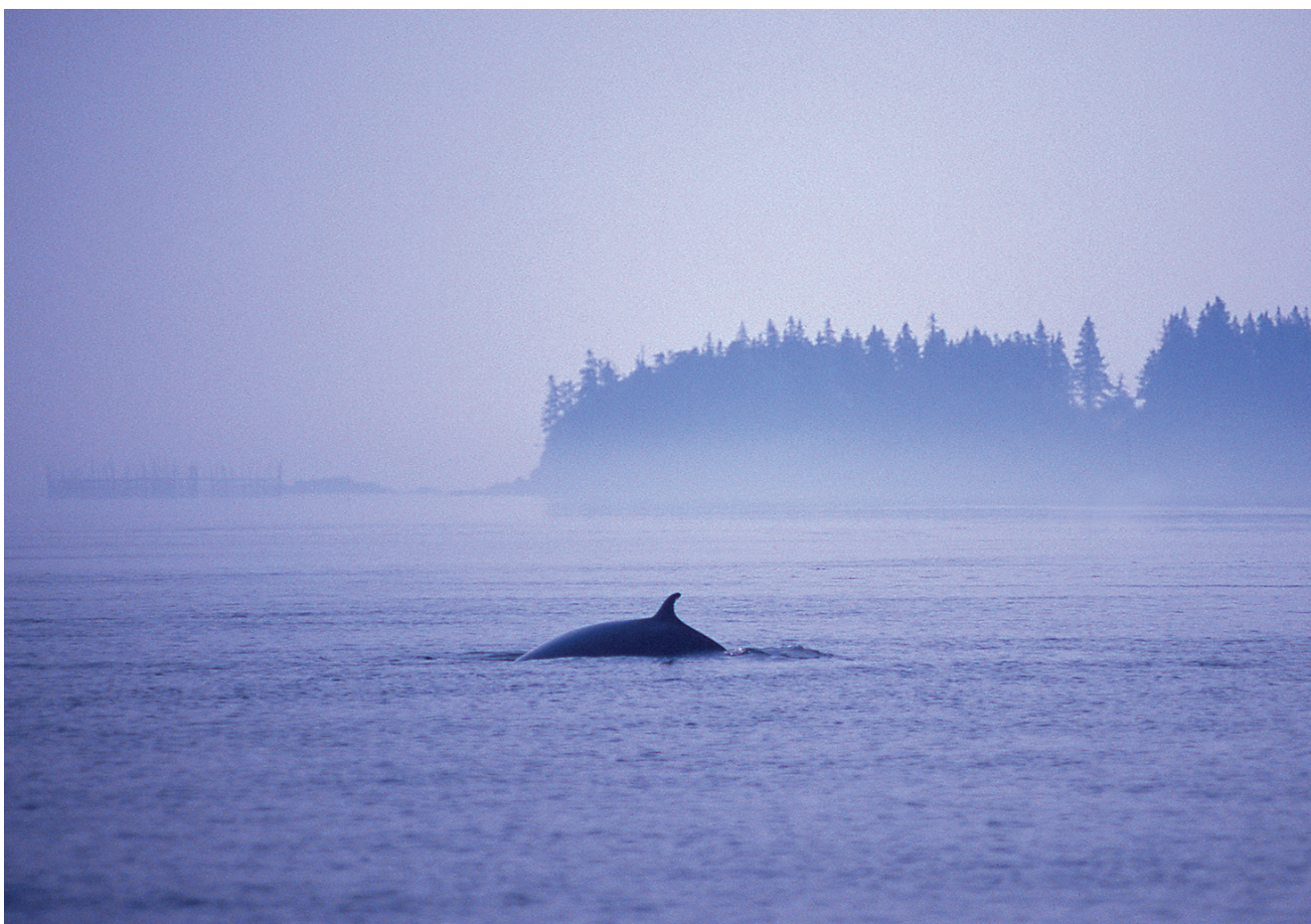
Minke whale ( Balaenoptera acutorostrata) in the early morning fog off Deer Island, New Brunswick. This species is monitored in the Labrador Straits as part of QLF's Marine Species At Risk Program.

QLF created International Programs nearly 40 years ago to foster an exchange of experience and innovations among organizations and individuals in communities and regions facing similar challenges and opportunities. Organized around a thematic focus on stewardship – efforts to create, nurture, and enable responsibility in landowners and resource users to manage and protect land and its natural and cultural heritage – the program works on a regional basis, nationally within the United States, and inside global frameworks.