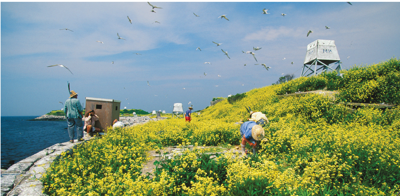
Great Gull Island is the largest nesting colony of Common and Roseate Terns in the Western Hemisphere. Common and Roseate Terns breed on Great Gull and migrate thousands of miles each fall to South America.