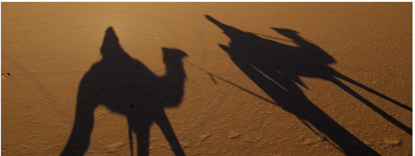
Early morning desert shadows, Wadi Rum, known as The Valley of the Moon in southern Jordan.

This program is tremendously exciting as the Rift Valley / Red Sea Flyway is one of the most important bird migration corridors in the world. Each spring, more than 500 million birds (consisting of 350 species) follow the Great Rift Valley where they diverge to Europe and Asia. Of these migrating birds, one and a half million are soaring birds.