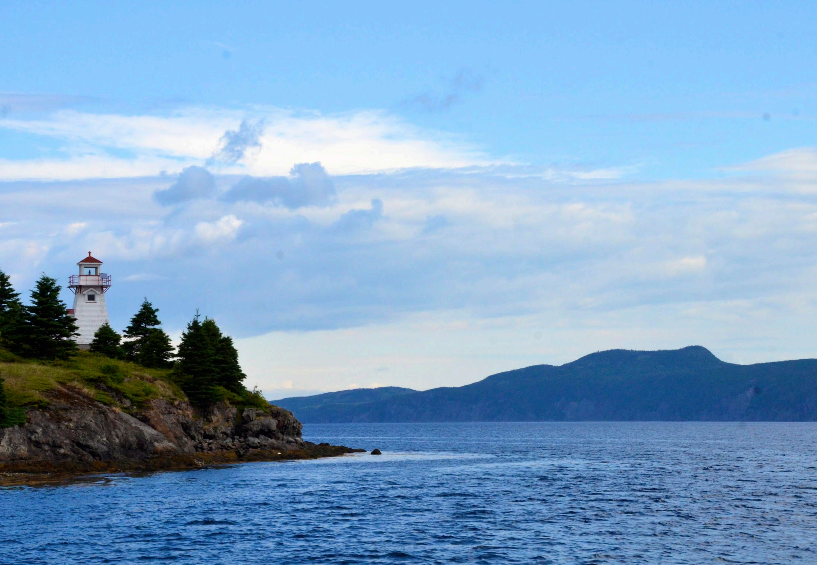
Gros Morne National Park, Great Northern Peninsula of Newfoundland.