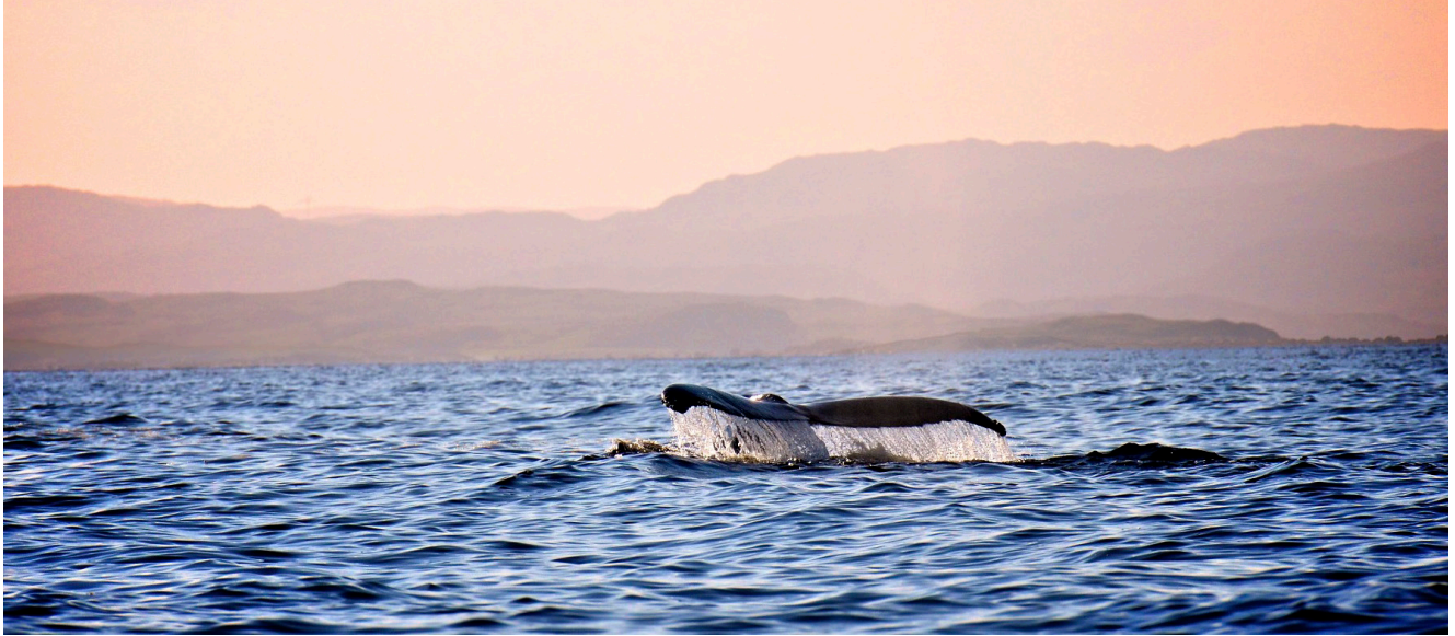
Humpback whale ( Megaptera novaeangliae ) off Conche, Newfoundland, monitored by QLF's Marine Species at Risk Program

Interns have an important role in coordinating several beach clean-ups in areas where plastic marine debris washes onshore and recording the volume and weight of that debris. These data points have substantiated the extent of the problem and helped inform the action strategies that are being implemented. QLF Interns also teach youth in schools and summer workshops about steps they can take to prevent marine debris from occurring.