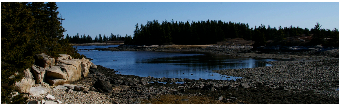
Schoodic Point, Acadia National Park, Winter Harbor, Maine.