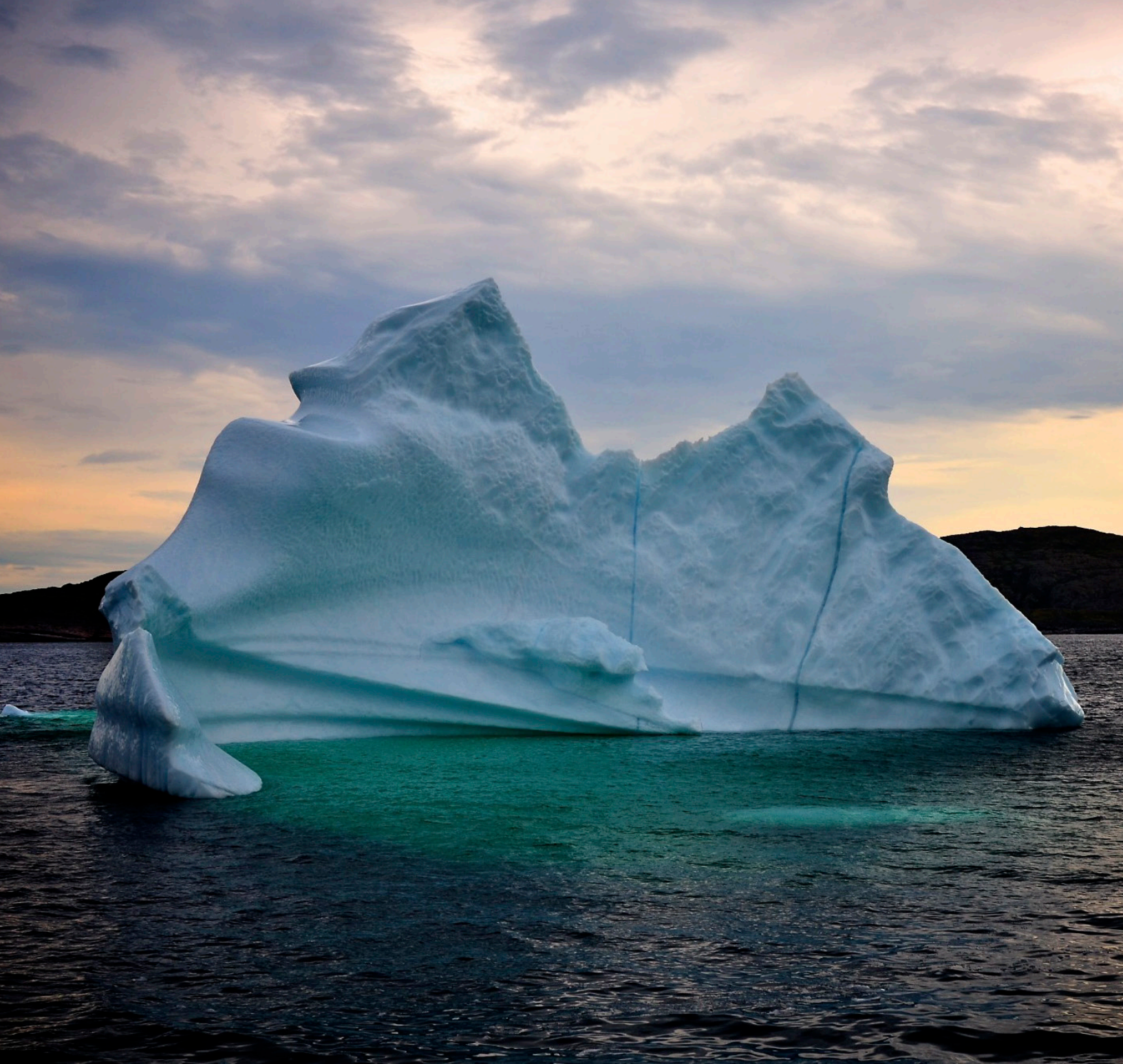
Off Red Bay, Labrador.