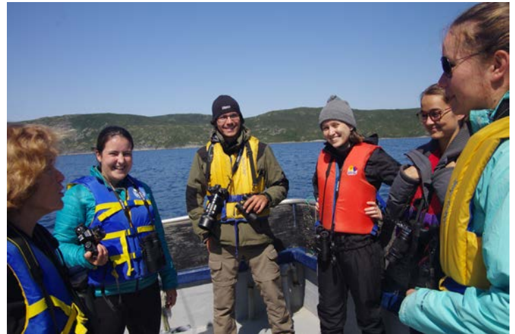
2018 Conservation Interns conduct a seabird monitoring survey off Conche, Newfoundland.

QLF encourages local communities to take an active role to manage natural resources, promote sustainable development, and address climate change through QLF's conservation initiatives across Eastern Canada and New England: Biodiversity Conservation, Marine Bird Conservation, Marine Debris, Piping Plover Conservation, Privately Protected Areas, Recovery of Marine Species at Risk, and Restoration of Coastal Habitats.