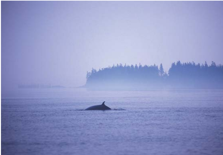
Minke whale in the early morning fog off Deer Island, New Brunswick. This species is being monitored in the Labrador Straits as part of QLF's Marine Species At Risk Program .