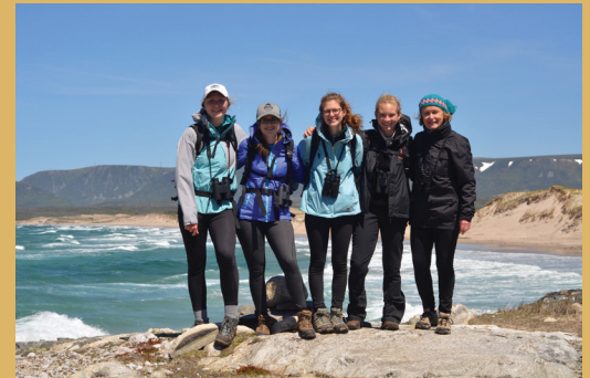
Next Generation Conservation Leaders, QLF Interns conduct a survey of endangered shorebirds along Newfoundland's southwest coast, 2017