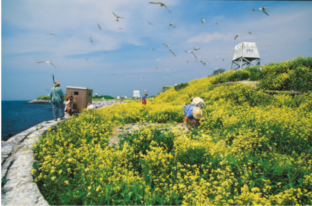
Great Gull Island is the largest nesting colony of Common and Roseate Terns in the Western Hemisphere. Common and Roseate Terns breed on Great Gull and migrate thousands of miles each fall to South America. The Great Gull Island Project of the American Museum of Natural History is the longest longitudinal study of Common and Roseate Terns in the Western Hemisphere. The Great Gull Island Project celebrates its 50th Anniversary in September 2018.

The Sounds Conservancy Marine Research Program ~ In 1995, QLF accepted The Sounds Conservancy Program with its endowed funds. The mission of The Sounds Conservancy is marine research, advocacy, and environmental education along the six Sounds and coastal waters of southern New England.