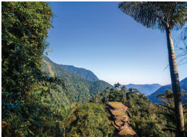
The Lost City, or Ciudad Perdida, in the Sierra Nevada de Santa Marta mountain range in Colombia

The FPSN recognizes the deep spiritual connection between local Indigenous peoples and their land. For its Native peoples, Mother Earth is considered their God. They have always worked to keep the natural environment alive as a tribute to Mother Earth. Guillermo writes, The Kogi people sustain a world view that protects resources, regulates consumptive use of the land, and allows natural regeneration to occur. In their "history" every action surges from a natural force that comes from those ancient beings that are present in each element. Tribe members' extensive knowledge of local plants and ecosystems is considered synonymous with religion and spirituality. When a wise person dies, the passing is perceived as "losing an encyclopedia." Lessons can be derived from the Indigenous communities within the Sierras that have discovered unique ways of living in harmony with the natural environment. They can and should guide efforts of collaborative management for the sustainable development.