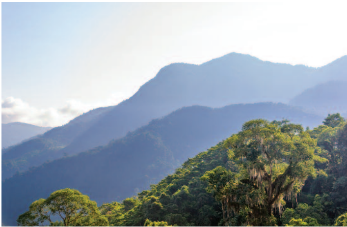
View of a jungle with hills in the background in the Sierra Nevada de Santa Marta in Colombia