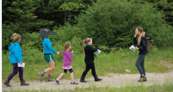
Environmental Education, Main Brook, Great Northern Peninsula of Newfoundland