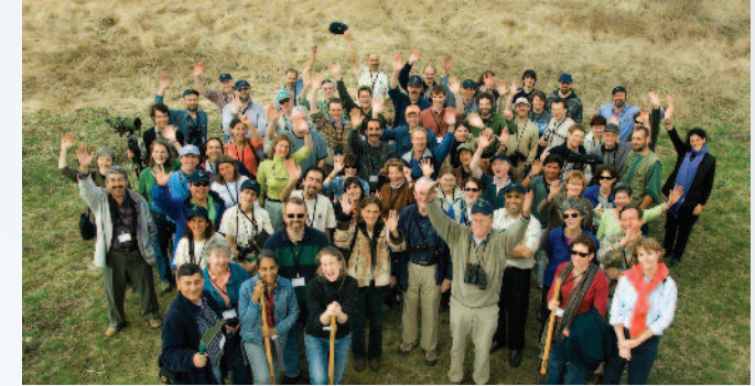
Tree Planting Exercise, QLF Alumni Congress, Hungary 2006