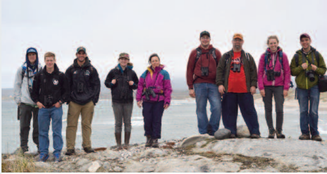
2015 Interns, Piping Plover Conservation Project, Southwest Newfoundland