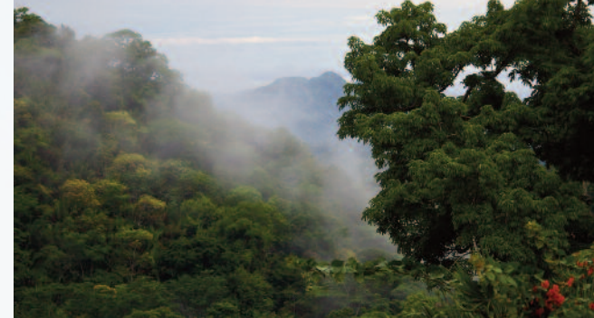
Maya Mountain Marine Corridor, Toledo District, Southern Belize