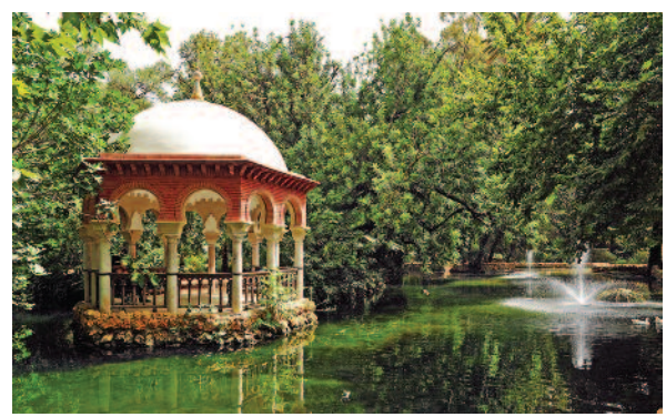
Duck Pond in the Maria Luisa Park. The Maria Luisa Park stretches along the Guadalquivir River in Seville, Spain. It is Seville's main green area.