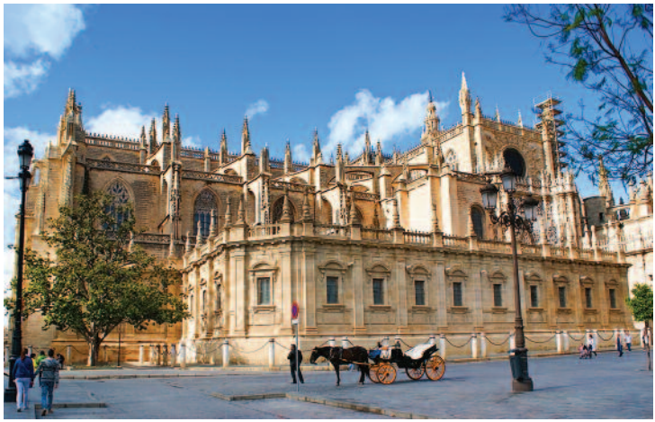
Seville Cathedral or the Cathedral of Saint Mary, Spain. It is a Roman Catholic cathedral and is the largest Gothic cathedral and the third largest church in the world. Opened in 1528.

The Alfonso XII Hotel (2 San Fernando 2, Seville, 41004, Spain (+34 95 491 70 00)) is located in the