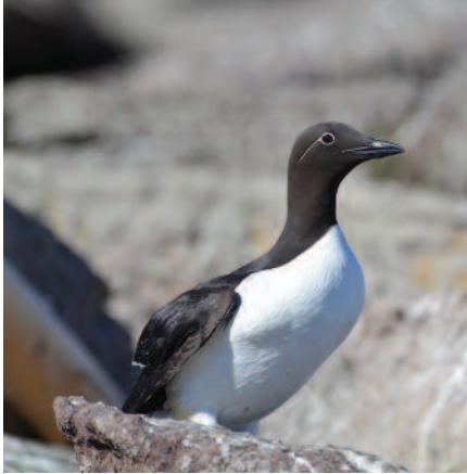
Common Murre on Perroquets Island, 2015

warden carving an eider duck decoy, or a young boy's look of satisfaction as a hand-held puffin launches into flight. There was no mistaking, the people loved their birds.