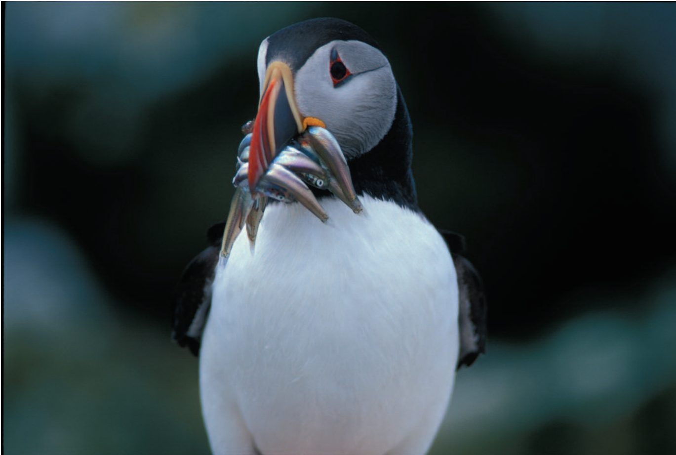
Atlantic Puffin on St. Mary's Island

Bermuda and New Zealand — sharing descriptions of the program model and the lessons learned. It was inspiring to hear of people’s commitment to similar causes in widely diverse settings. Many instinctively believed in the efficacy of the community-based approach, but lacked convincing evidence that it led to conservation success. The results of the Marine Bird Conservation Program’s longitudinal study gave scientists the evidence they were seeking and policy-makers the justification for why community engagement should be funded.