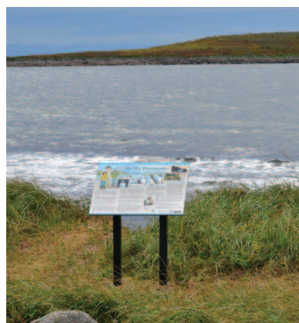
The new interpretive panel describing Ile aux Perroquets (Perroquets Island), 2017

The diorama features 13 mounted specimens representing seven species of seabirds and sea ducks common along the Quebec North Shore. The centerpiece is a large fiberglass outcrop of Canadian Shield, on which are life-like mounts of locally breeding alcids: Common Murre, Razorbill, Atlantic Puffin, and Black Guillemot. The groundcover is a re-creation of the heath habitat, including authentic plant and lichen specimens from the region: three-toothed cinquefoil, cranberry, crowberry, and reindeer lichen. We marveled at how well they held up for decades. We