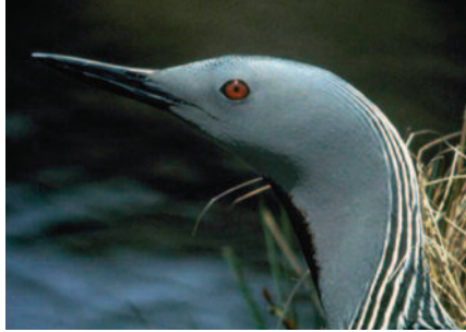
The Red-throated Loon nests at the St. Mary's Islands Seabird Sanctuary.

The threat to seabirds of illegal hunting and eggging is much less severe than in decades past; however, new threats have emerged and other historic ones remain. Seabirds need our help today as ever before. The effects of climate change on marine conditions, depletion and availability of forage fish, oil pollution, plastic debris, by-catch in fishing nets, and disturbance at the colonies are some of the current threats to seabirds in the Atlantic