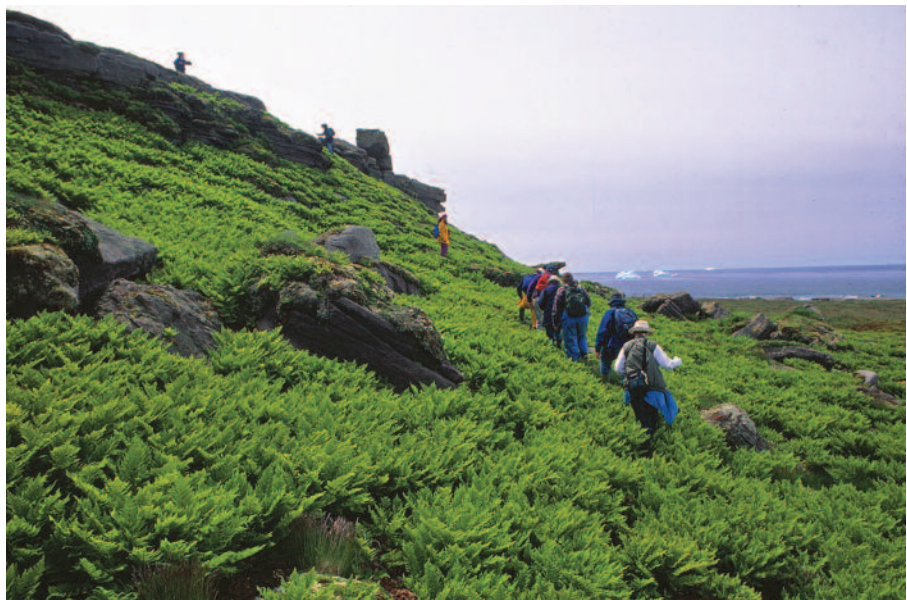
Members of Bird Protection Quebec visit Perroquets Island on a study-tour led by QLF in the early 1990s.