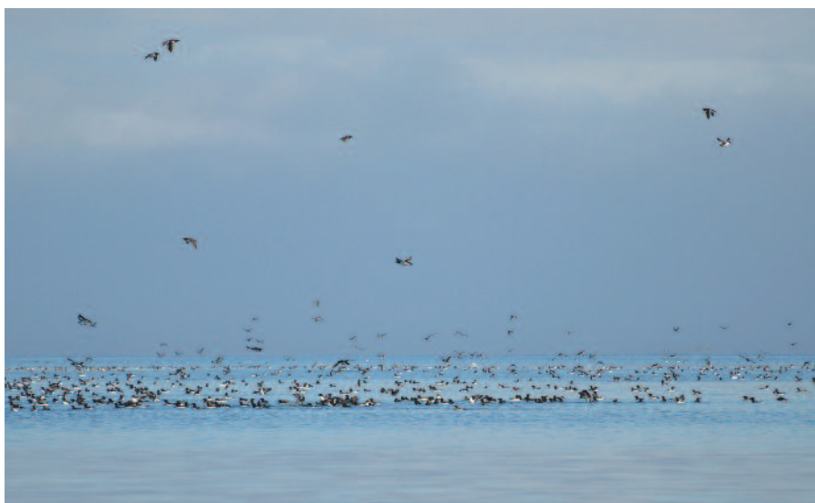
Razorbills and Common Murres on the sea at Perroquets Island, where their populations have been increasing in recent years. 2015.