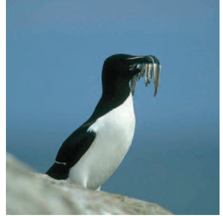
Razorbill on St. Mary's Island

Within the first decade, we saw evidence that the program was achieving its three main objectives: an increase in the populations of breeding seabirds; improvements in local knowledge, support, and conservation behaviors; and greater local involvement in seabird conservation. Breeding populations of puffin, Razorbill, Common Murre, and Common Eider increased, as reported by Canadian Wildlife Service and based on results of a census which the Canadian Wildlife Service conducts every five years. The program achieved a reduction in the main threats, namely, hunting, egg harvesting, and habitat disturbance in the colonies. Scientists with