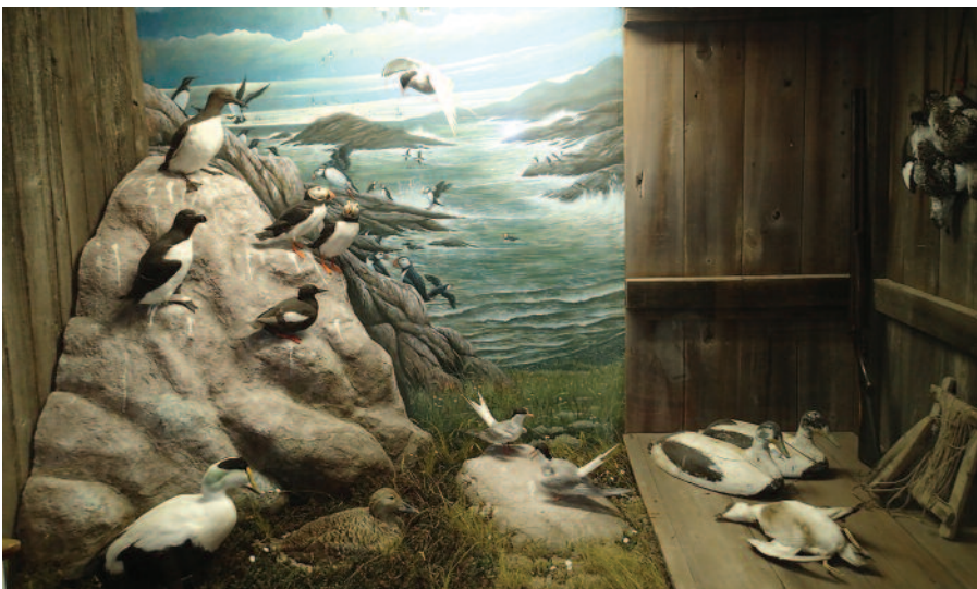
The seabird diorama, on display at QLF Headquarters 1982-2017, interpreted the important relationship between seabirds and the people of the Quebec Lower North Shore.