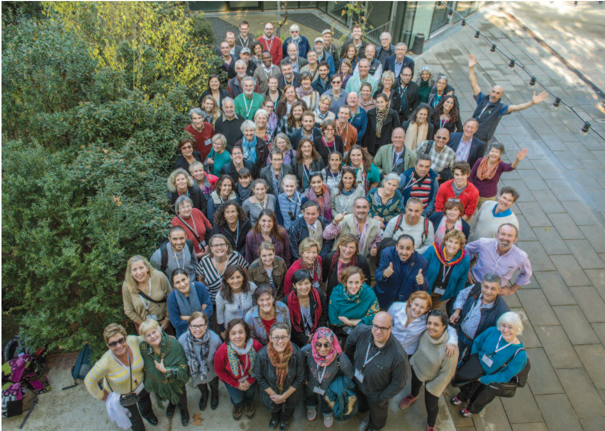
Congress participants at the conclusion of the Workshop Plenary Session, Món Sant Benet, El Bages region, Catalonia