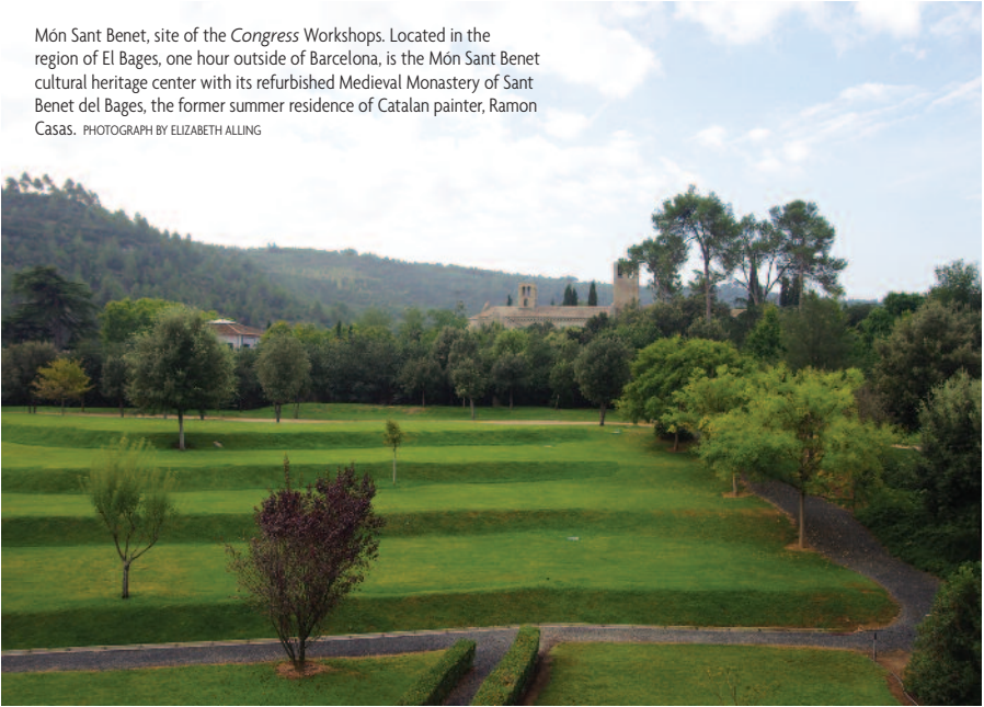
Món Sant Benet, site of the Congress Workshops. Located in the region of El Bages, one hour outside of Barcelona, is the Món Sant Benet cultural heritage center with its refurbished Medieval Monastery of Sant Benet del Bages, the former summer residence of Catalan painter, Ramon Casas.

Thank you all—and welcome to the Congress!