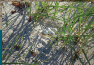
Piping Plover nesting site, Codroy Valley, Newfoundland