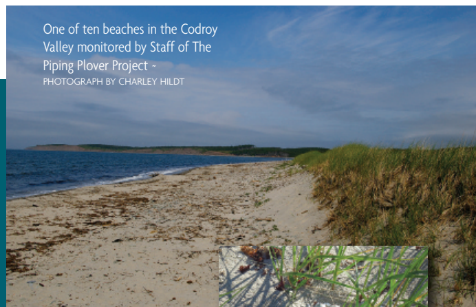
One of ten beaches in the Codroy Valley monitored by Staff of The Piping Plover Project