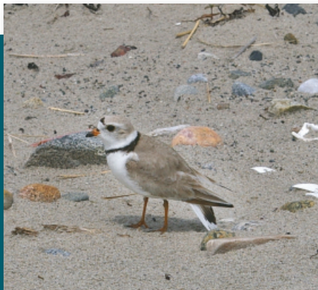
Piping Plover ( Charadrius melodus)