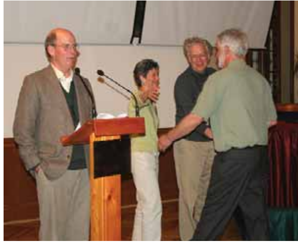
Caption will go here