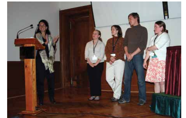
Caption will go here