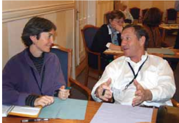
Caption will go here