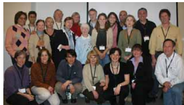
Caption will go here

A second theme revolved around empowerment, including developing leadership, creating networks, and building local skills. Discussion also focused on economic opportunities related to cultural heritage, including sustainable tourism and craft production. An interesting tension was identified between tourism and cultural authenticity: how to maintain authenticity while meeting the expectations of tourists.