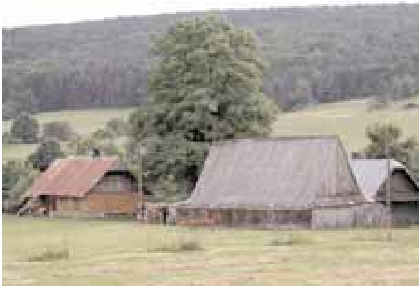
Caption will go here

Upon returning to the States, QLF Trustees shared with us their observations on the Stewardship Workshop. Some of those observations follow.