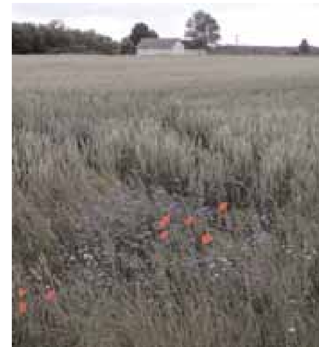
Caption will go here

Worldwide, conservation strategies are becoming more inclusive, recognizing natural as well as cultural values, encompassing the interests of local communities, and