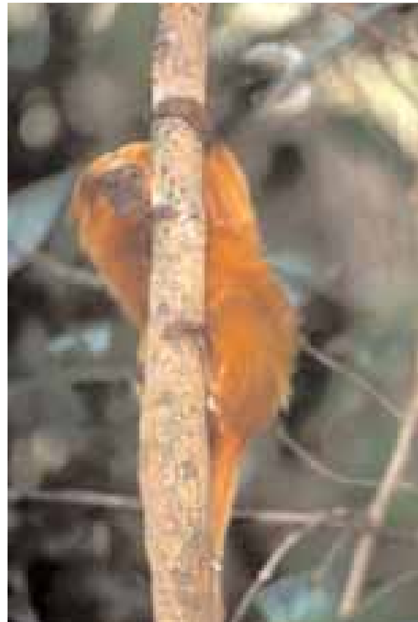
Caption will go here

What do new marine reserves in Belize, archaeological sites in Israel and Palestine, heritage rivers in Canada,