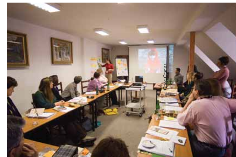
Caption will go here

When people make genuine connections with their natural environment, are given appropriate tools to understand and protect it, and are, above all, enjoying the experience, this ethic can emerge spontaneously. We can return to our respective countries and educational programs with renewed inspiration to foster this learning process as well as a deeper understanding of how our work connects to one another's and to the global conservation movement.