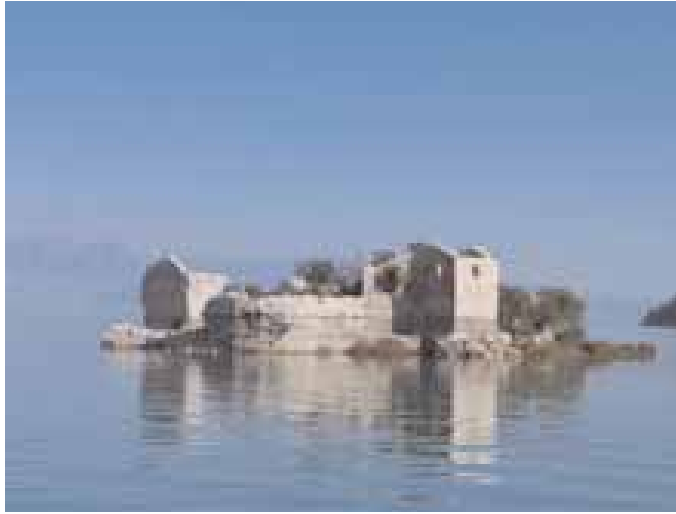
Caption will go here