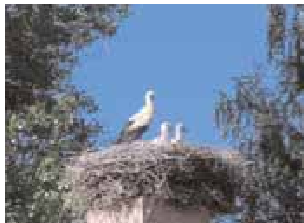
Caption will go here