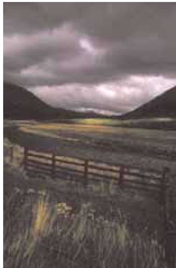
Caption will go here

Wil Maheia - Toledo Institute for Development & Environment