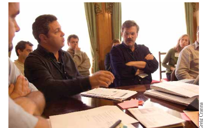
Caption will go here

The value of information exchange was frequently cited. For example, one of the newer projects is working on an amendment to tax law to introduce incentives for