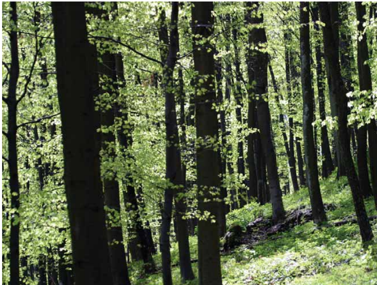
Bükk National Park

tion leading to the stewardship of our natural and cultural resources. The Workshop was designed to explore new directions in nature conservation, sustainable community development, and cultural heritage through group discussions and case study presentations by alumni and participating partners.