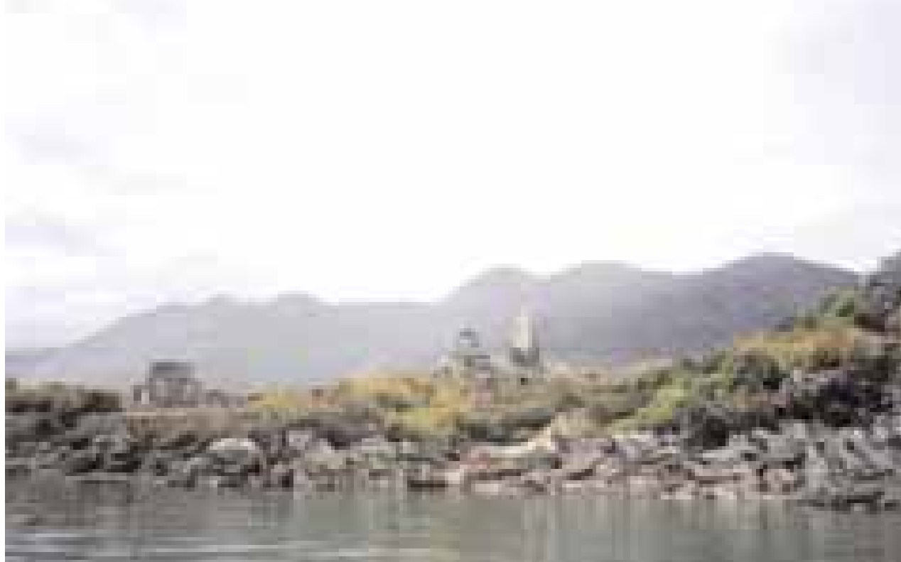
Caption will go here

There were tears, and hugs, and times of deafening silence but central to everything was the desire and need to work together — to share our resources and support each other — the biodiversity of the planet depends on it.