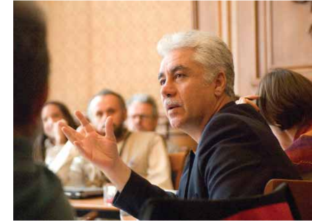
Caption will go here

politically unstable countries can’t make allowances for nature conservation, and many sectors of the population have not been empowered with biodiversity conservation. Government control should be challenged.