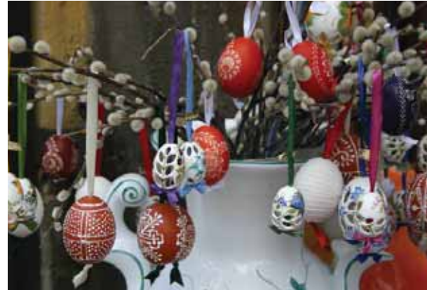
Caption will go here